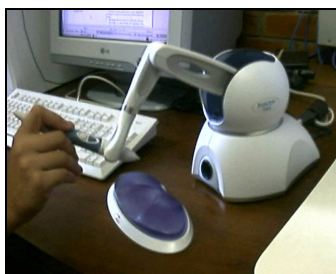
FIGURE. 1 HAPTIC DEVICE USED IN VR SYSTEMS.

Virtual reality systems for training can provide significant benefits over other methods of training, mainly in critical medical procedures. In some cases, those procedures are performed without any kind of visualization and the only information received is noticed by the touch sensations provided by a robotic device with force feedback. These devices can measure forces and torque applied during the user interaction [26] and these data can be used in an evaluation [5,24]. A specific kind of haptic device, as the presented in Figure 1, is based on a robotic arm and provides force feedback and tactile sensations during user manipulation of objects in a three dimensional scene. This way, user can feel objects texture, density, elasticity and consistency. Since the objects have physical properties, a user can identify them in a 3D scene (without see them) by the use of this kind of device [9]. This is especially interesting in medical applications to simulate proceedings in which visual information is not available. One of the main reasons for the use of such haptic devices in medical applications is their manipulation similarity when compared to real surgical tools.