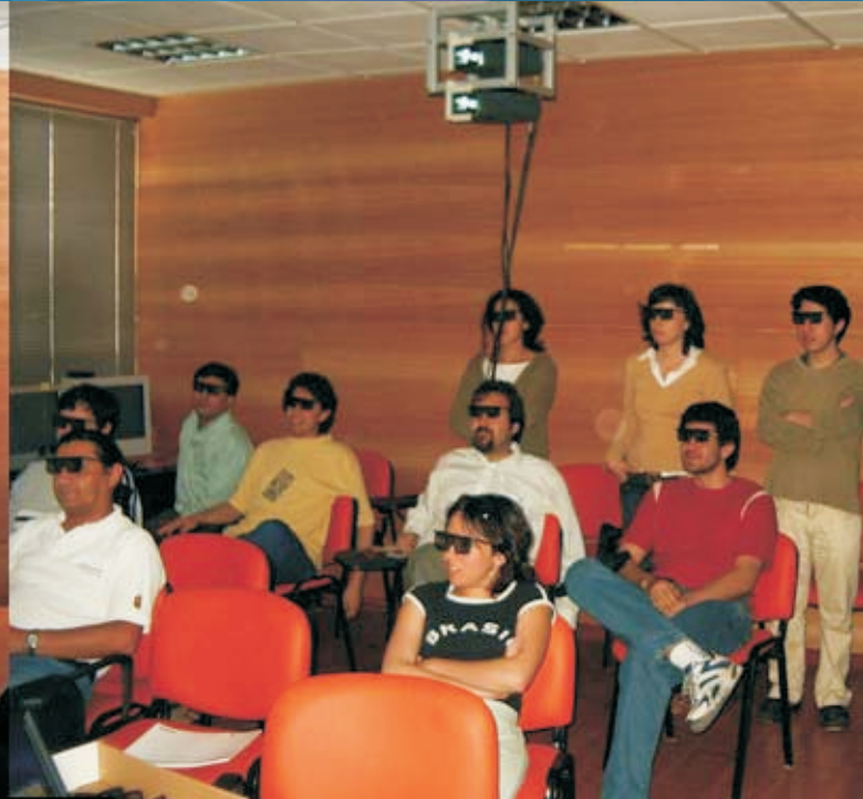
easy3D - Universidade de Talca (Chile)